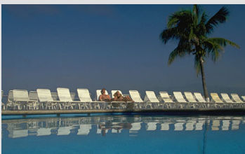
HOTELS & RESORTS